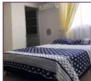
Hotel Neller Plaza