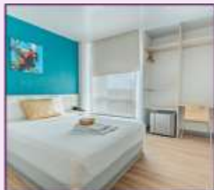
Hotel Quinto Nivel