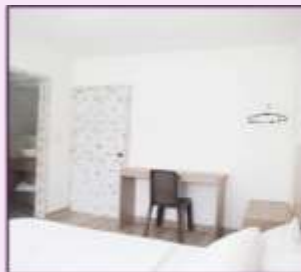
Hotel Pórtico Suite